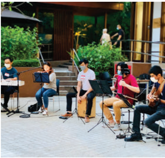
Friends from The TENG Ensemble brought us live music.