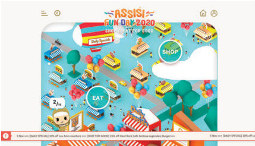
Website of Assisi Fun Day E-Edition

With safe-distancing being the new norm since COVID-19, Assisi Hospice held the E-Edition of its well-loved annual fundraising event – Assisi Fun Day from 5-15 Nov 2020. During these challenging times with drop in donations, our partners and members of the public showed their support through providing yummy food, merchandise and services for the e-stalls, sponsoring stalls, making purchases and direct donations.