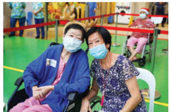
Our patient spending precious moments with her loved one.

With infection control measures in place, they enjoyed an energetic cheerleading performance by adorable children from Albirex Singapore Cheer Dance School. They were also serenaded by a performance of the song "Silent Night" using special handbells by the Senior Boleh Chimes Choir, formed by our patients, and Christmas songs by staff from Assisi Hospice and Mount Alvernia Hospital. The evening ended with the light-up of our giant Christmas tree and sparkly fireworks. We would like to thank our co-organiser, Sembcorp Industries for their strong support and continuing their tradition of bringing Christmas cheer to our patients by distributing goodie bags and spending time doing Christmas crafts with our patients.