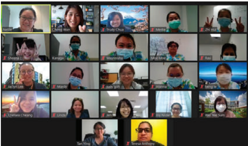
Our colleagues attending Communication Training via Zoom.

In palliative care, patients and families are often facing challenging times in their lives. Effective communication skills are essential to provide timely care and comfort to them. From July to September 2020, most of our clinical and patient-facing staff, including nurses, doctors and creative therapists went through a series of Communication Training sessions, which were specially developed and curated to meet the needs of our staff, including general communication in healthcare, needs specific to palliative care and complexities of patient and family interactions.