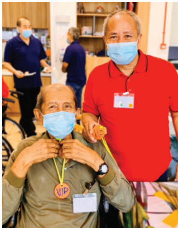
Our patients showered with special "VIP" medals.

Our patients were touched by the overwhelming support of our Assisi Shop in Lazada and overjoyed that they could give back to Assisi with the work of their hands! In the two weeks in August 2020 leading up to Teacher's Day, over 100 handmade products by our patients were sold, raising over $750 for Assisi Hospice. To show our appreciation to our patients for their labour of love and to celebrate the wonderful response, we organised a simple ceremony and showered them with special "VIP" medals and flowers.