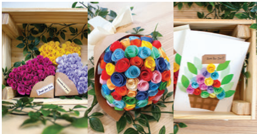
Products handmade by patients were hot favourites as Teacher's Day gifts.

Our patients were touched by the overwhelming support of our Assisi Shop in Lazada and overjoyed that they could give back to Assisi with the work of their hands! In the two weeks in August 2020 leading up to Teacher's Day, over 100 handmade products by our patients were sold, raising over $750 for Assisi Hospice. To show our appreciation to our patients for their labour of love and to celebrate the wonderful response, we organised a simple ceremony and showered them with special "VIP" medals and flowers.