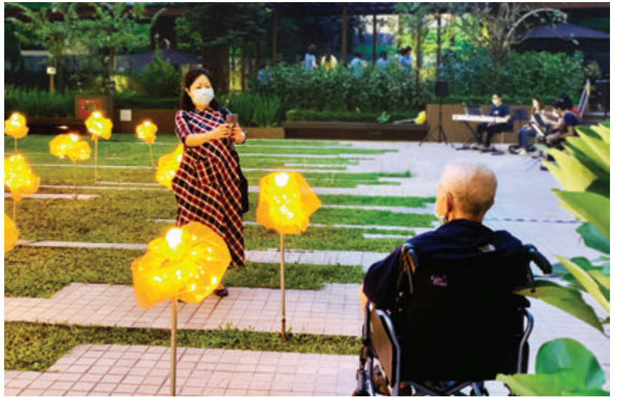
Our patient and caregiver enjoying the stroll and photo-taking with the “moon flowers”.

Our Courtyard was transformed to a sea of orange “moon flowers” to reflect the magical Mid-Autumn moonlight! Our patients and their caregivers had a memorable night celebrating Mid-Autumn Festival on 17 Sep 2020, making their very own “moon flowers” and taking a leisurely stroll amongst them. Despite the Covid-19 pandemic, our friends from City Developments Limited continued their yearly tradition of celebrating Mid-Autumn with our patients, with infection control measures in place. They brought festive cheer by joining our Day Care patients in the “moon flower” making and distributing mooncakes at the Inpatient wards. Friends from The TENG Ensemble made our moon flower stroll more magical with live rendition of classics like “城里的月光”.